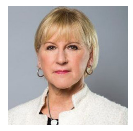
Margot Wallstrom Chair, IHRB Former European Environment Commissioner and Vice-President of the European Commission; former Foreign Minister of Sweden

IHRB's International Advisory Council is composed of influential thinkers across business, government, finance, trade unions, civil society, and academia. Membership is currently being renewed, with an update to be announced in 2023.